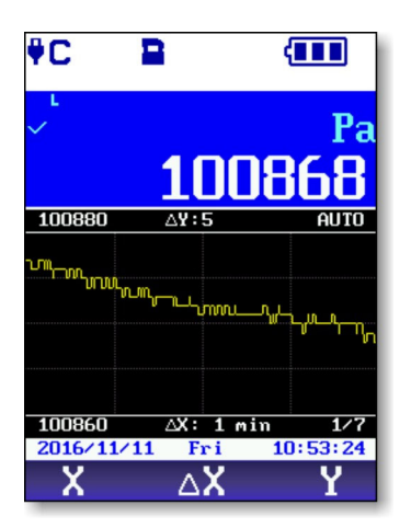
Real time measurement graph